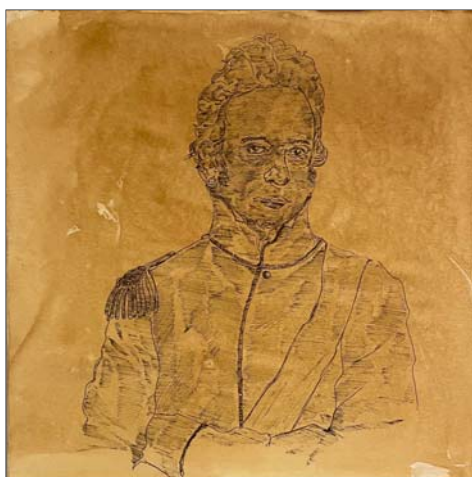
Gaius Catullus, or Jerry, Duke of Charleston. (South Carolina). Plotter (2021)

Ink, coffee, and tea on paper, mounted on panel 16 in x 16 in (40.64 x 40.64 cm) SOLD