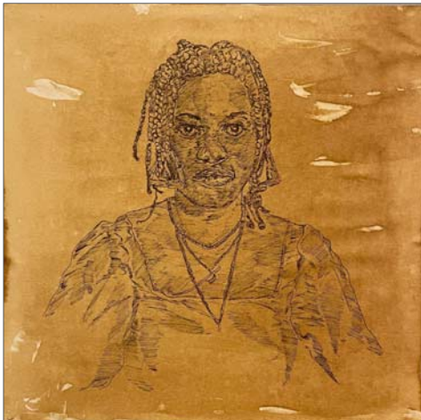
Abena, a sorceress and abolitionist. Not so secretly tied to the rebel movement. (2021)

Ink, coffee, and tea on paper, mounted on panel 12 in x 12 in (30.48 x 30.48 cm) SOLD