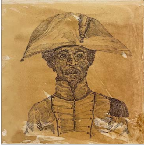
Philemon, the Pious. Commodore of a Frengland allied merchant fleet but secretly working with Amadou to impress slave trading in the Atlantic. A mysterious man. (2021)

Ink, coffee, and tea on paper, mounted on panel 12 in x 12 in (30.48 x 30.48 cm) SOLD