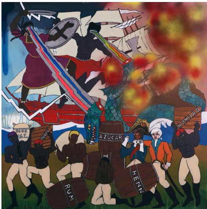
We will allow you to keep the lesser half of the shit you think you own. Shango and Oya destroy an empty, outgoing slave ship while allowing a crimson corvette to deposit the trade goods for the fete at Belhaven Manor. Don't fuck with the cosmic gods. (2021)

Acrylic and spray paint on canvas 48 in x 48 in ( 121.9 x 121.9 cm) SOLD