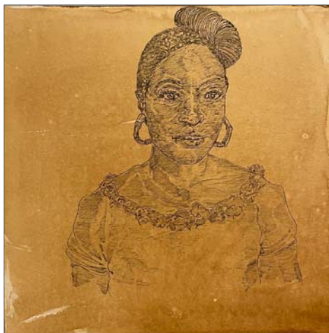
Claire Fontaine. A creole woman from Martinique who supplies weapons to the abolitionists but manages to never get caught. (2021)

Ink, coffee, and tea on paper, mounted on panel 12 in x 12 in (30.48 x 30.48 cm) Price on Request