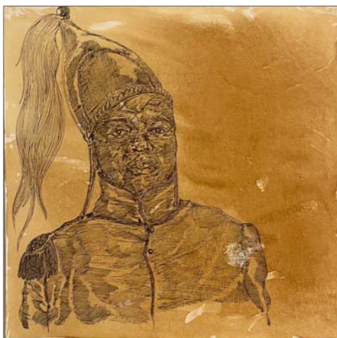
Kwame, Dragoon, first class and sworn protector of Call Tyrone. (2021)

Ink, coffee, and tea on paper, mounted on panel 12 in x 12 in (30.48 x 30.48 cm) SOLD