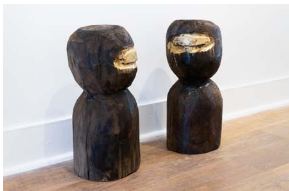
Sentinel 1 (2021) Sentinel 2 (2021)

Ink, coffee, and tea on paper, mounted on panel 12 in x 12 in (30.48 x 30.48 cm) SOLD