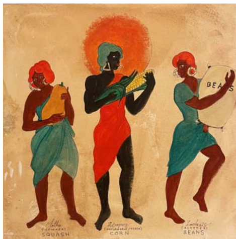
The three fates, The three sisters. Clotho (squash), Atropos (corn), Lachesis (beans) (2021)

Ink, coffee, and tea on paper, mounted on panel 12 in x 12 in (30.48 x 30.48 cm) SOLD