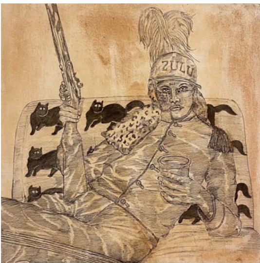
Patty Hurts. Former paid informant turned rebel leader who planned and executed the raid on the dinner party. Sponsored by the Spanish government in America and the Rice and Indigo barons of South Carolina. (2021)

Ink, coffee, and tea on paper, mounted on panel 16 in x 16 in (40.64 x 40.64 cm) HOLD