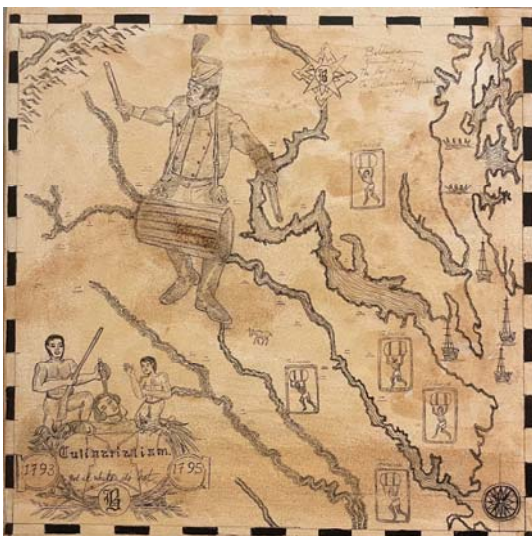
Culinarialism. Get it while it's hot! Map of the greater Belhaven area. 1793-1795 (2021)

Ink, coffee, and tea on paper, mounted on panel 16 in x 16 in (40.64 x 40.64 cm) SOLD