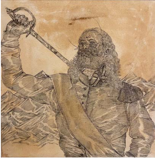
Lord Robert Sidney, 4th earl of Belhaven and ruler of the Belhaven Republic in a triumphant pose. (2021)

Ink, coffee, and tea on paper, mounted on panel 16 in x 16 in (40.64 x 40.64 cm) HOLD