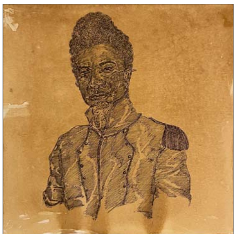
Call Tyrone, Leader of the Free rebel forces of Virginia. Born diplomat. (2021)

Ink, coffee, and tea on paper, mounted on panel 12 in x 12 in (30.48 x 30.48 cm) SOLD