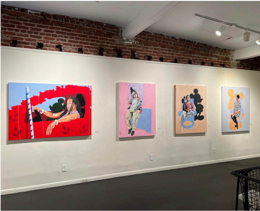
An installation view of E.L. Briscoe's series "Thought Bubbles."

disenfranchised people are helpless by depicting them in visually potent scenarios. In his pictures, the fusion of naturalism and fabulism suggests that the greatest superpower is imagination.